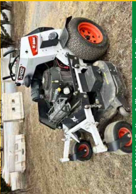
Bobcat ZS4000- Like New- Selling for Secured Creditors