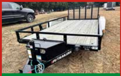
New/Unused PJ T/A w/Rails