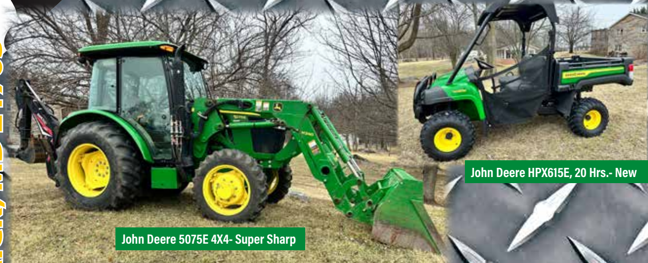
John Deere 5075E 4X4- Super Sharp