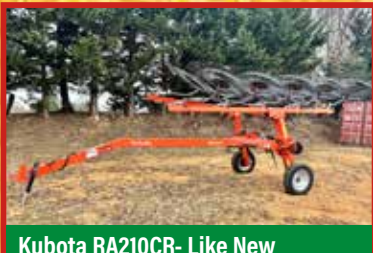
Kubota RA210CR- Like New