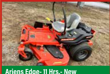
Ariens Edge- 11 Hrs.- New