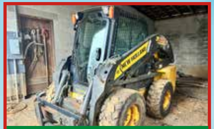
New Holland 223