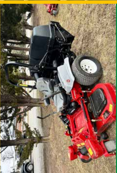
ExMark Lazer Z E-Series, 12.5 Hrs.- New