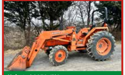
Kubota L2850 4X4