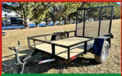
New/Unused MCT S/A w/Rails