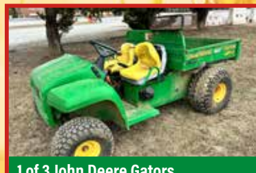
1 of 3 John Deere Gators