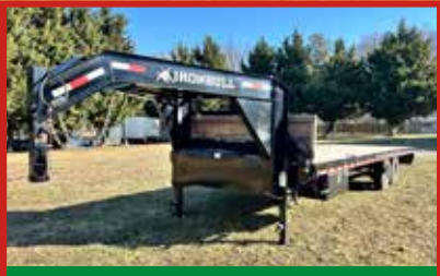
2022 Iron Bull T/A- Like New