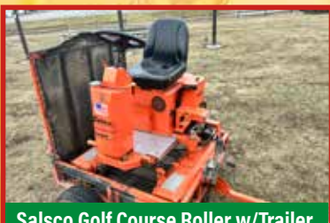
Salsco Golf Course Roller w/Trailer