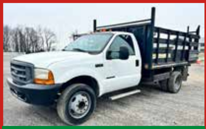
Ford F450 Power Stroke

Many healthy and fresh plants! Some of the best nursery stock selection!