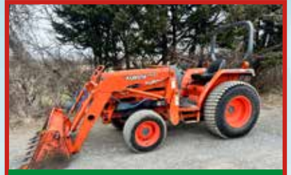
Kubota L3300 4X4