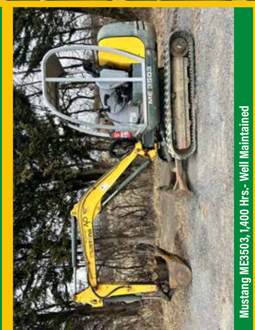
Mustang ME3503, 1,400 Hrs.- Well Maintained