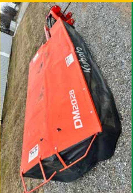
Kubota DM2028- Same As New