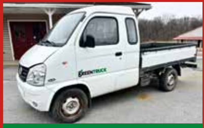
2018 Vantage Electric