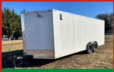
New/Unused Lark T/A