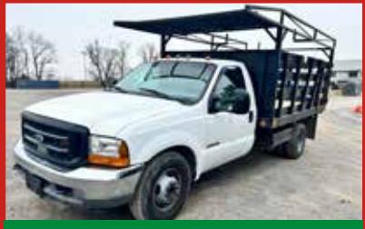
Ford F350 Power Stroke