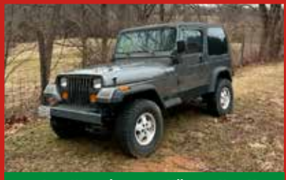
1989 Jeep Wrangler, 5,000 Miles on New Motor