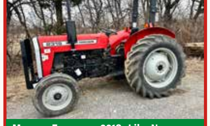
Massey Ferguson 231S- Like New