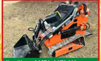
New/Unused AGT Ind. YF2-380