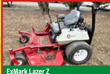
ExMark Lazer Z