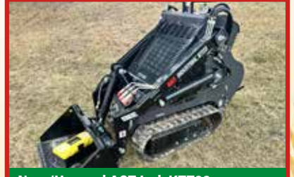
New/Unused AGT Ind. KTT23