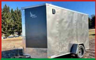
New/Unused Lark S/A